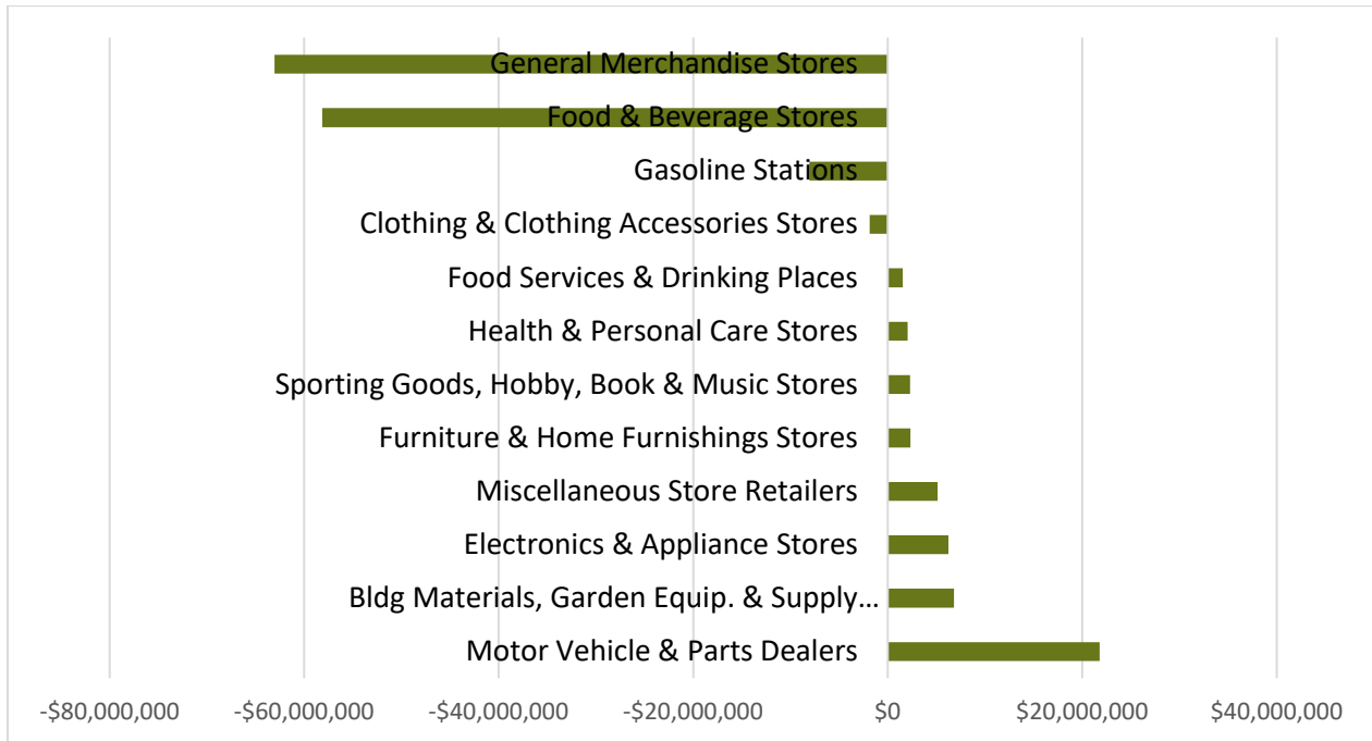
Figure 3. Annual Retail Potential ($ millions) by Industry within the 1-Mile Trade Area